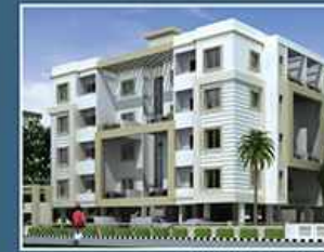
VEDANT PLATINUM Manish Nagar