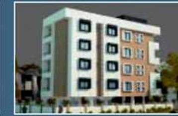
VEDANT DELUX Narendra Nagar