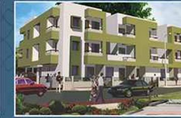
VEDANT GLORY Swawalambi Nagar