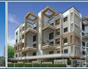
VEDANT EMERALD PHASE-I Sahakar Nagar