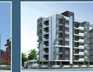
SWAMI SAMARTH ENCLAVE Zingabai Takli, Godhani Road