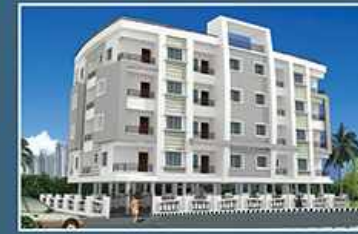
VEDANT OPAL Gawande Layout