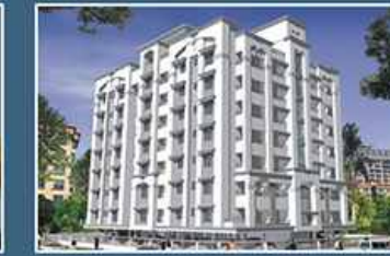
VEDANT PEARL Sneha Nagar