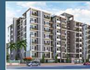
VEDANT TANZANITE New Sahakar Nagar