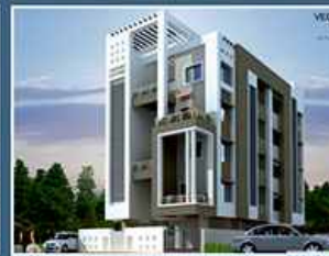
VEDANT OLIVINE Sneh Nagar, Khamla