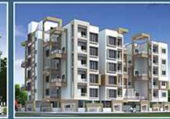
VEDANT EMERALD PHASE-II Sahakar Nagar