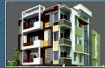
VAIBHAVI APARTMENT Hudkeswar