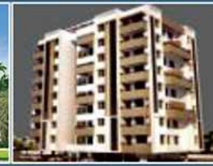
VEDANT SAPPHIRE "B" Old Sneha Nagar