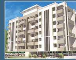
VEDANT SAPPHIRE "A" Old Sneha Nagar