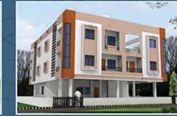
VEDANT ELEGANCE Swawalambi Nagar