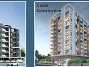
VEDANT AQUAMARINE New Sahakar Nagar