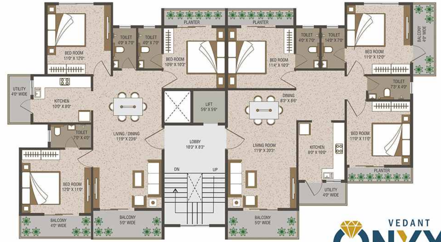
2nd TO 7th FLOOR PLAN