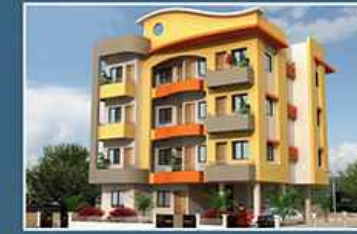
VEDANT DESIRE Swawalambi Nagar