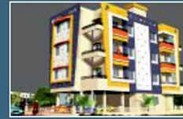
RANJANA ENCLAVE Pandey Layout