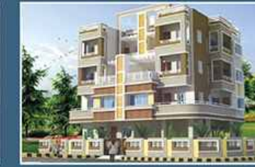
VEDANT CLASSIC Swawalambi Nagar