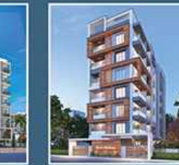
VEDANT AMBER Pandey Layout