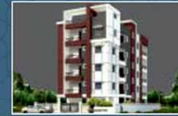
VIBHUTI APARTMENT Narendra Nagar