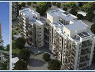
VEDANT DIAMOND Sneh Nagar, Khamla