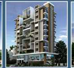
VEDANT PERIDOT Bajaj Nagar