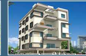
VEDANT GOLD Pratap Nagar